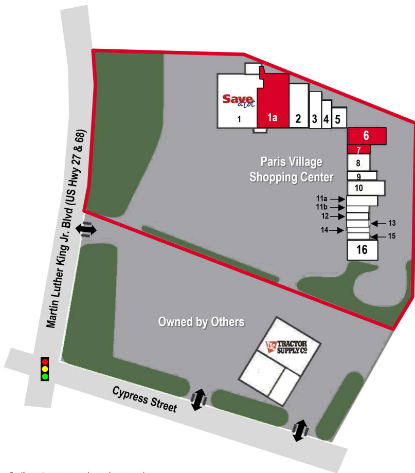
For illustration purposes only; not drawn to scale