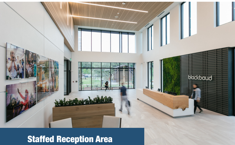
Staffed Reception Area