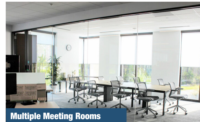
Multiple Meeting Rooms