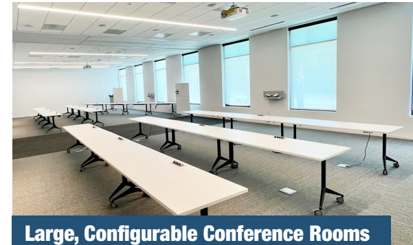
Large, Configurable Conference Rooms