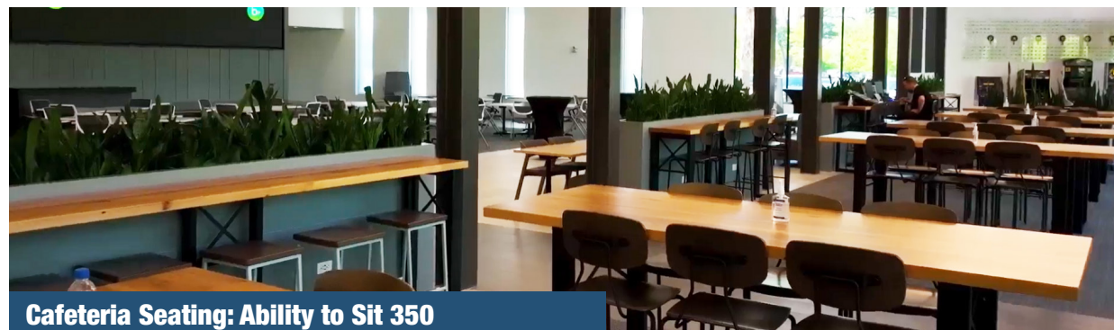
Cafeteria Seating: Ability to Sit 350