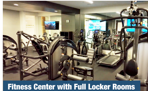
Fitness Center with Full Locker Rooms