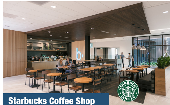
Starbucks Coffee Shop