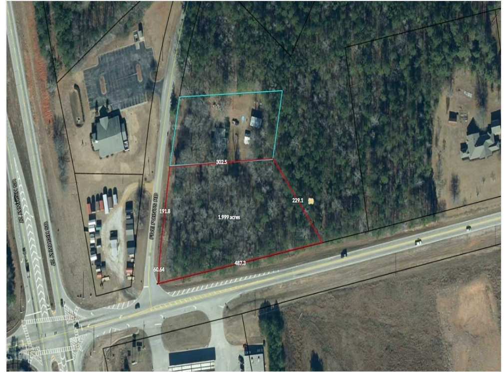
Buchanan 2 Acres