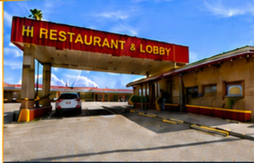
RESTAURANT & LOBBY ENTRANCE