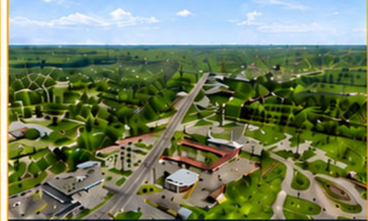
HIGHWAY FRONTAGE & LOCATION