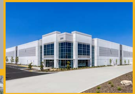
2204 Coffee Road