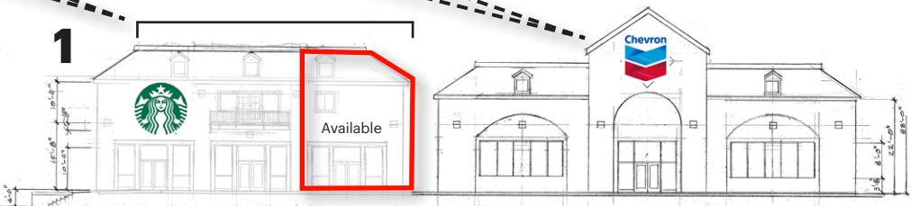
Site Plan and Elevations Subject to change