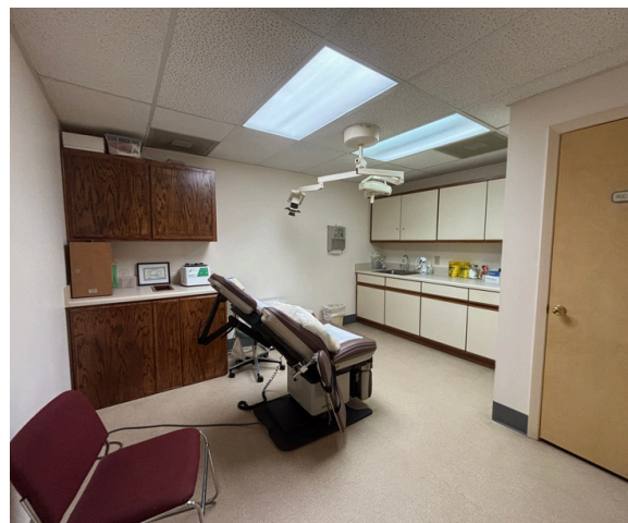
OCONEE COUNTY TAX MAP NO 207-05-01-032