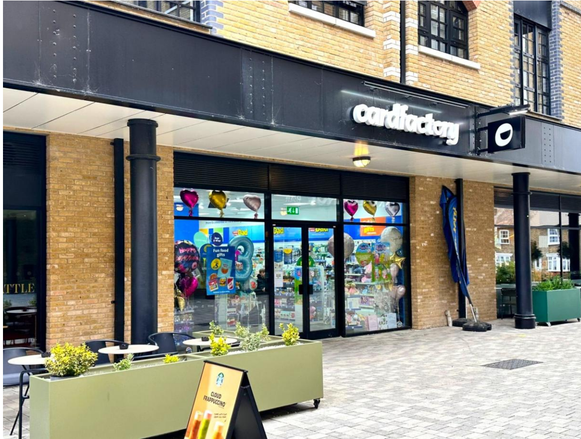
Unit 1A – Card Factory