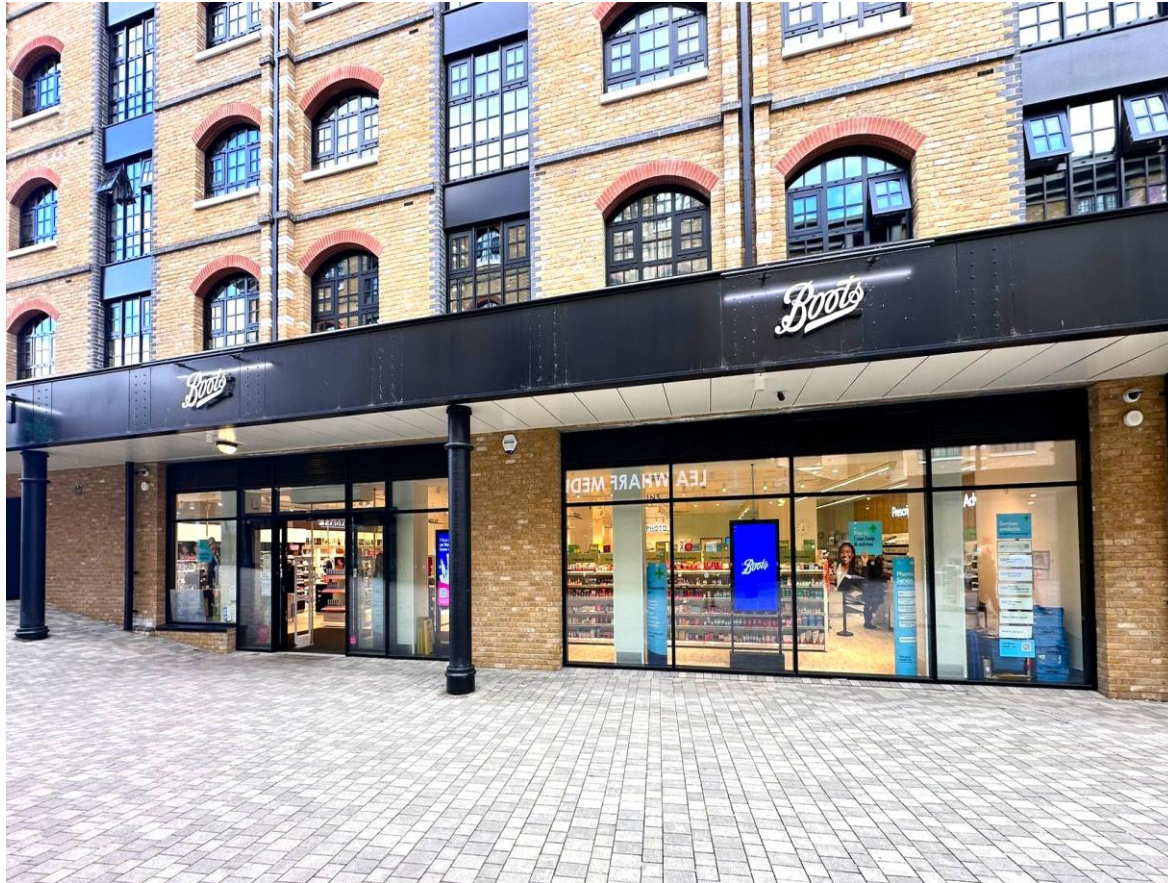
Unit 3 – Boots