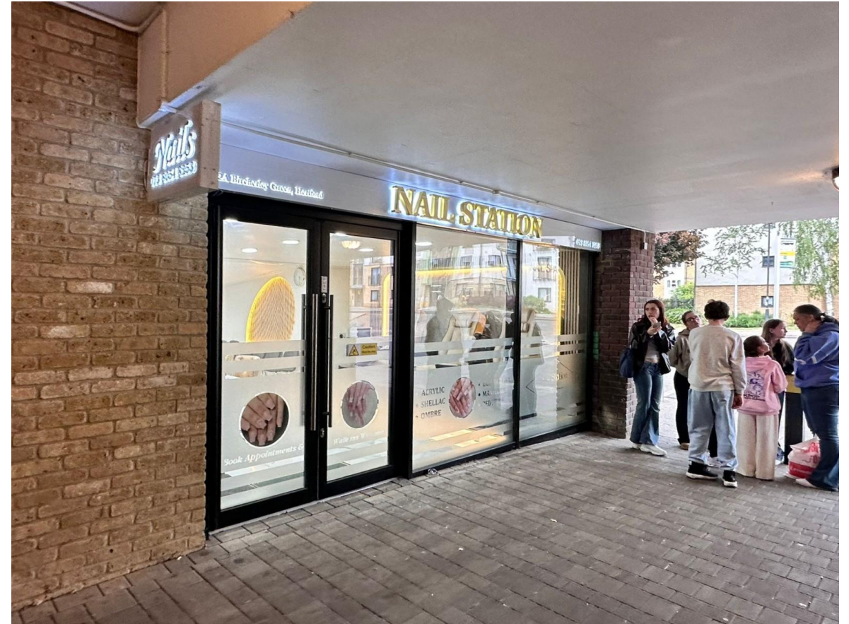
Unit 8 – Nail Salon