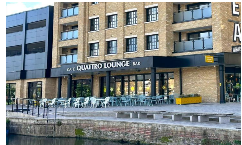
Unit 4 & 5 – Quattro Lounge