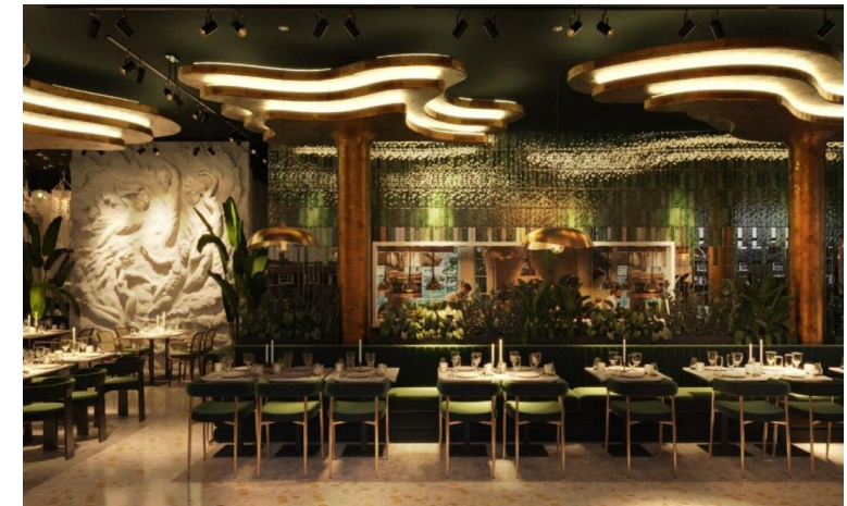
Unit 1 – Harley's Bistro & Lounge