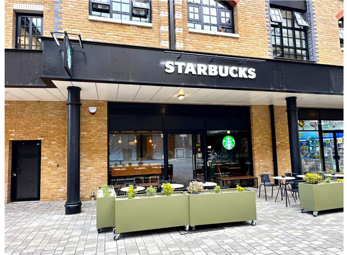
Unit 2 – Starbucks