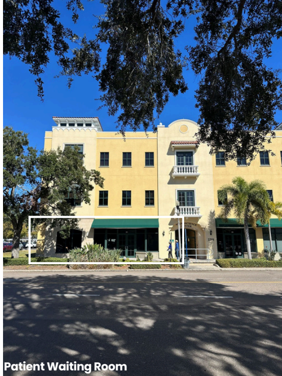
Patient Waiting Room

2,296 RSF space available for lease. Suite is located at the highly visible Central Avenue.