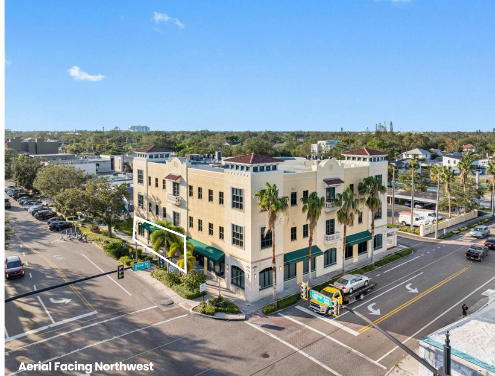
Aerial Facing Northwest