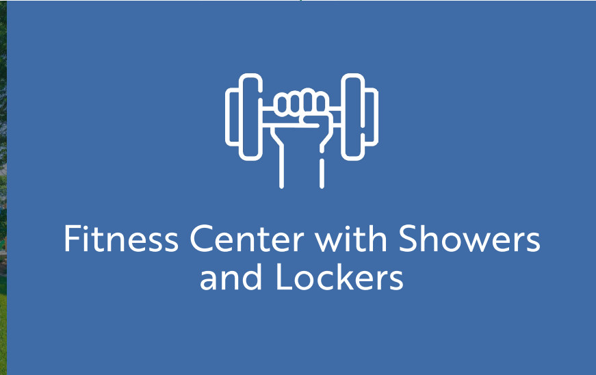
Fitness Center with Showers and Lockers