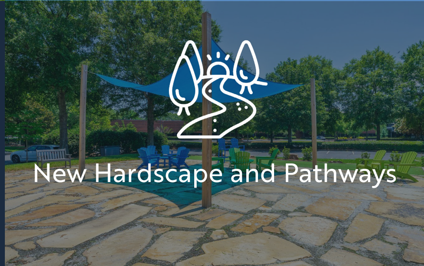
New Hardscape and Pathways