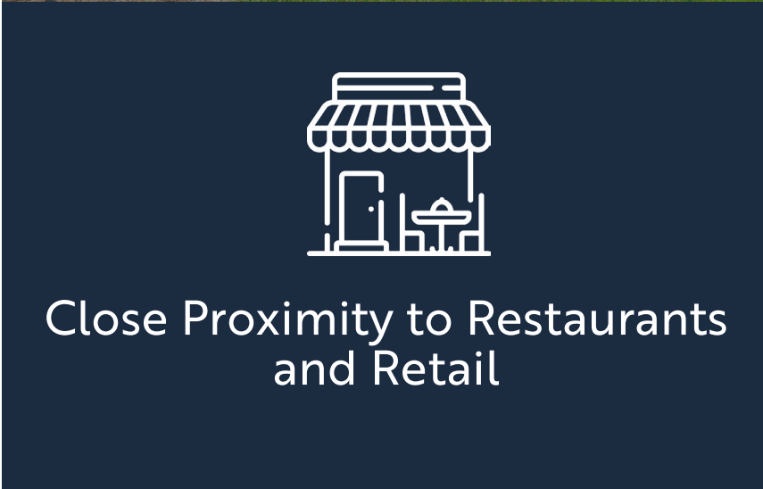
Close Proximity to Restaurants and Retail