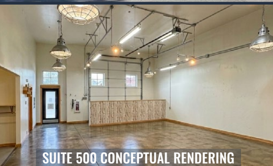
SUITE 500 CONCEPTUAL RENDERING