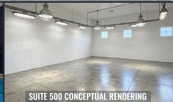
SUITE 500 CONCEPTUAL RENDERING