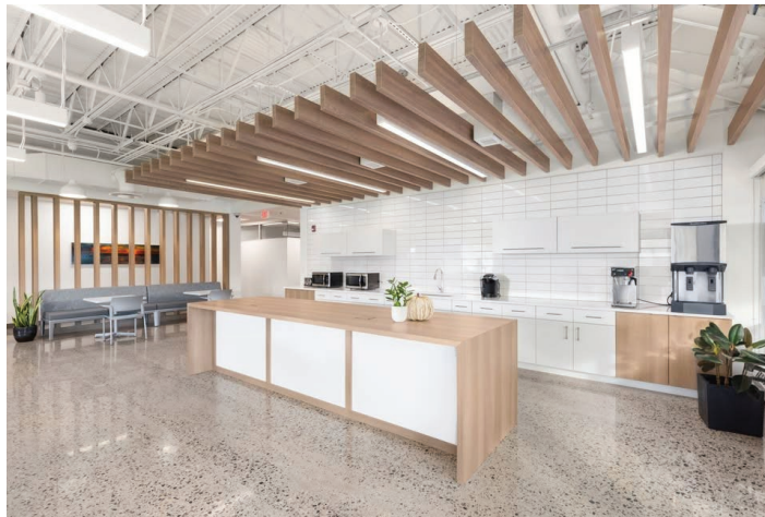
SHARED BREAKROOM WITH CAFETERIA STYLE SEATING