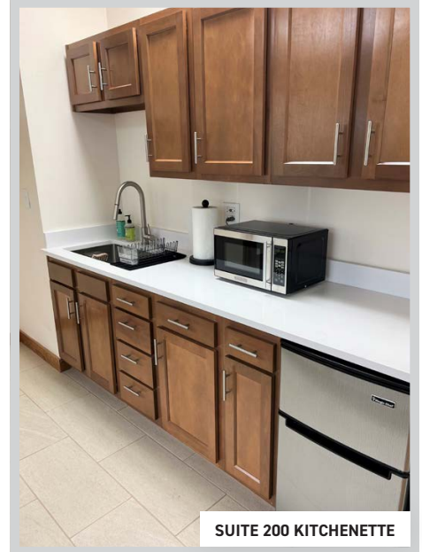
SUITE 200 KITCHENETTE