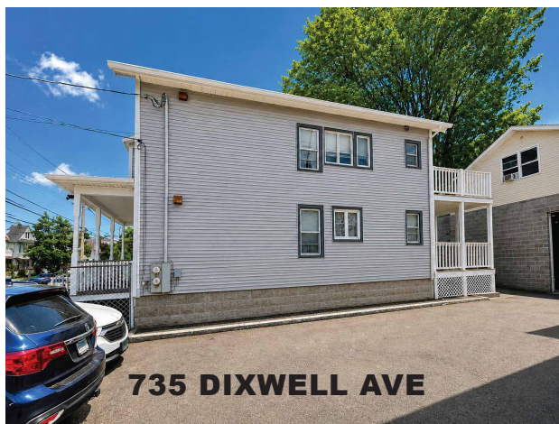
735 DIXWELL AVE