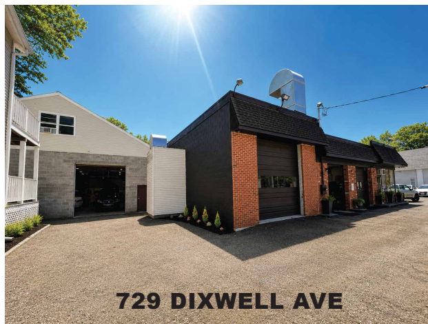
729 DIXWELL AVE