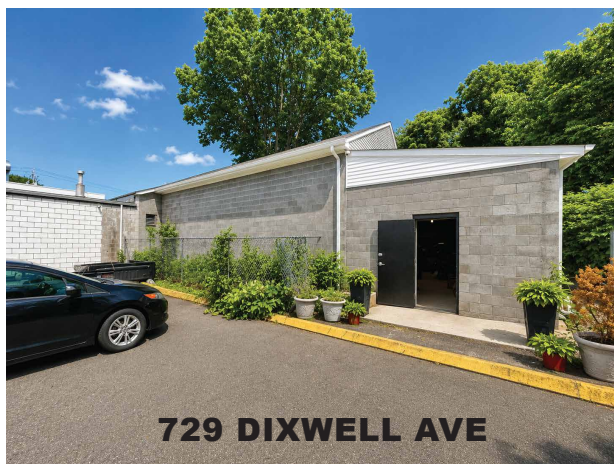
729 DIXWELL AVE