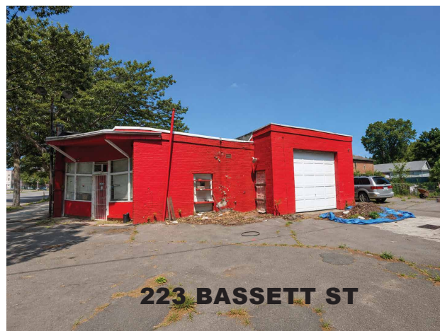
223 BASSETT ST