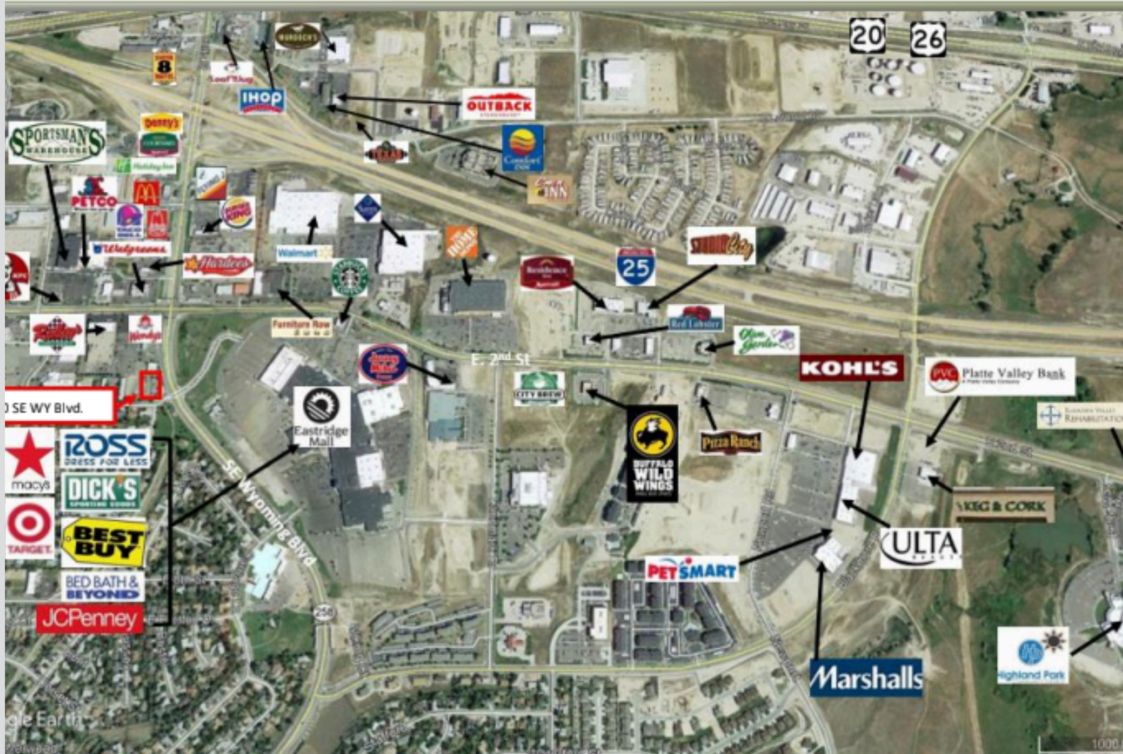
Aerial map of nearby businesses