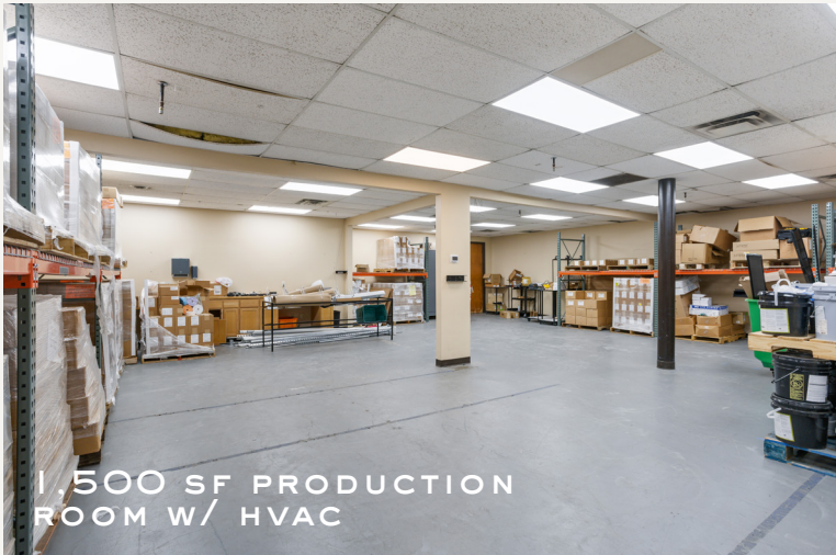
1,500 SF PRODUCTION ROOM W/ HVAC