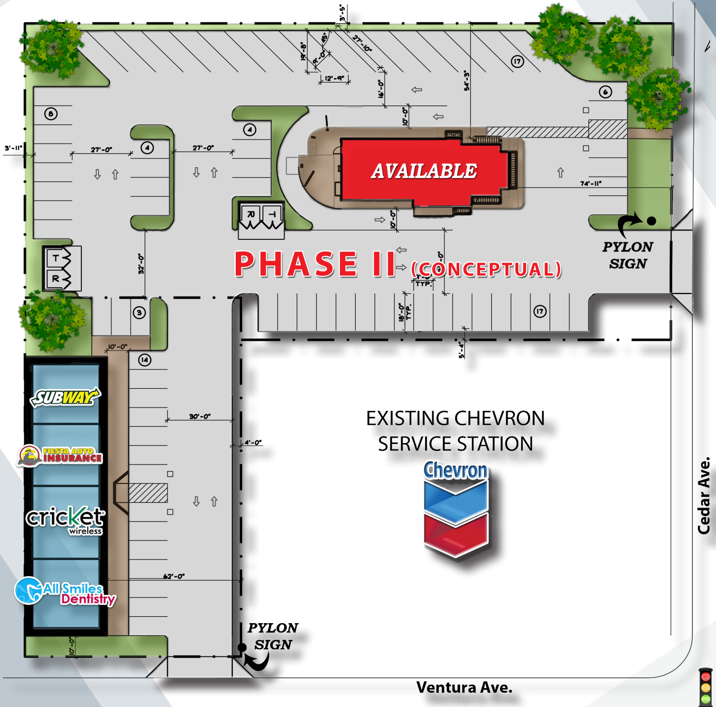
Site Plan B