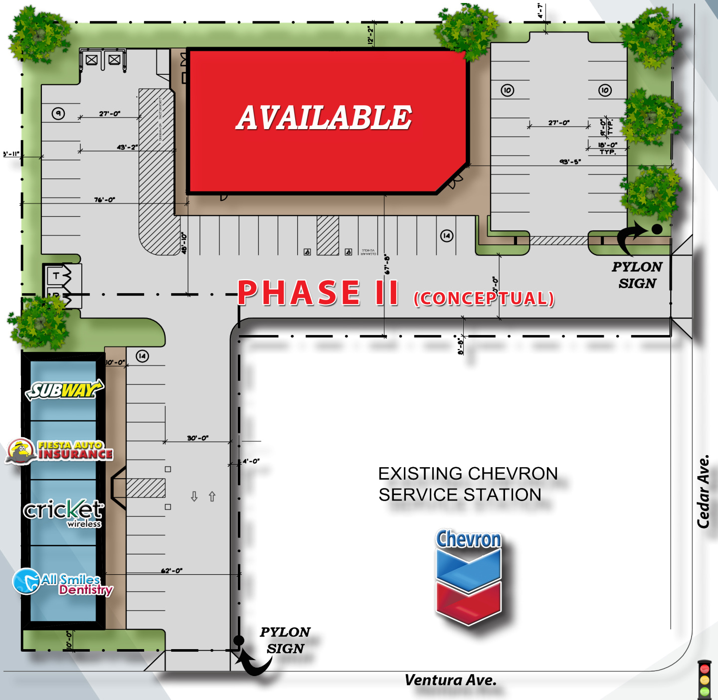
Site Plan A