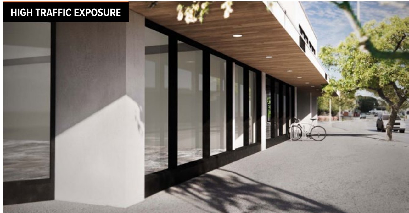
HIGH TRAFFIC EXPOSURE

Formerly known as Nanaimo's a&b sound flagship, the site has been transformed into a mix of commercial and street-front retail that seamlessly blends indoor and outdoor spaces together.