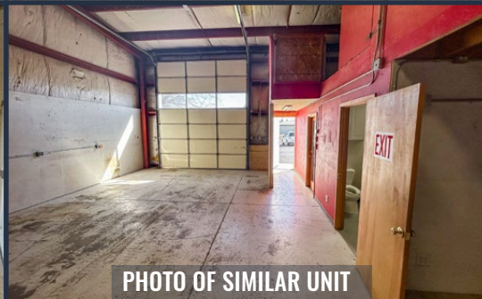
PHOTO OF SIMILAR UNIT