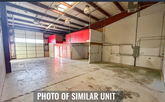
PHOTO OF SIMILAR UNIT