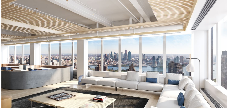
TOP OF HOUSE LOUNGE