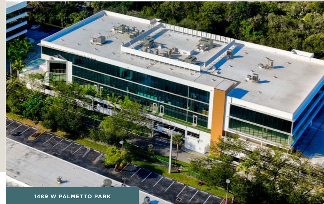
1489 W PALMETTO PARK