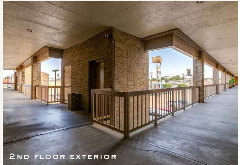
2ND FLOOR EXTERIOR