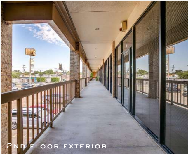
2ND FLOOR EXTERIOR