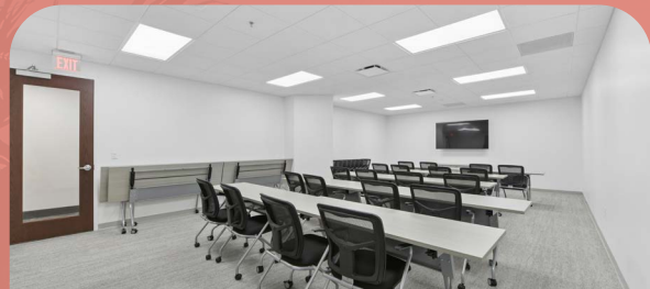
Tenant Conference & Training Center