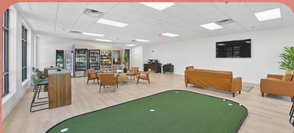
Tenant Lounge with Grab & Go Food