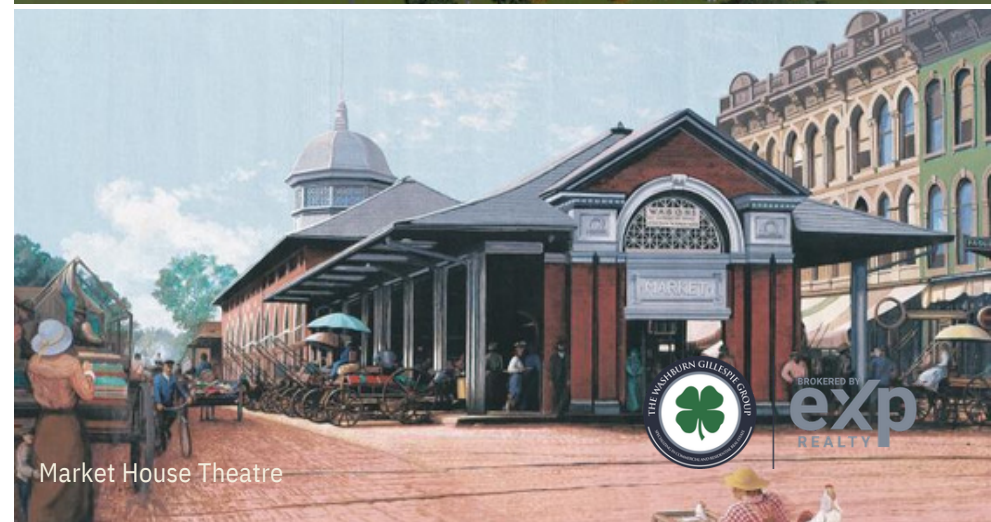
Market House Theatre