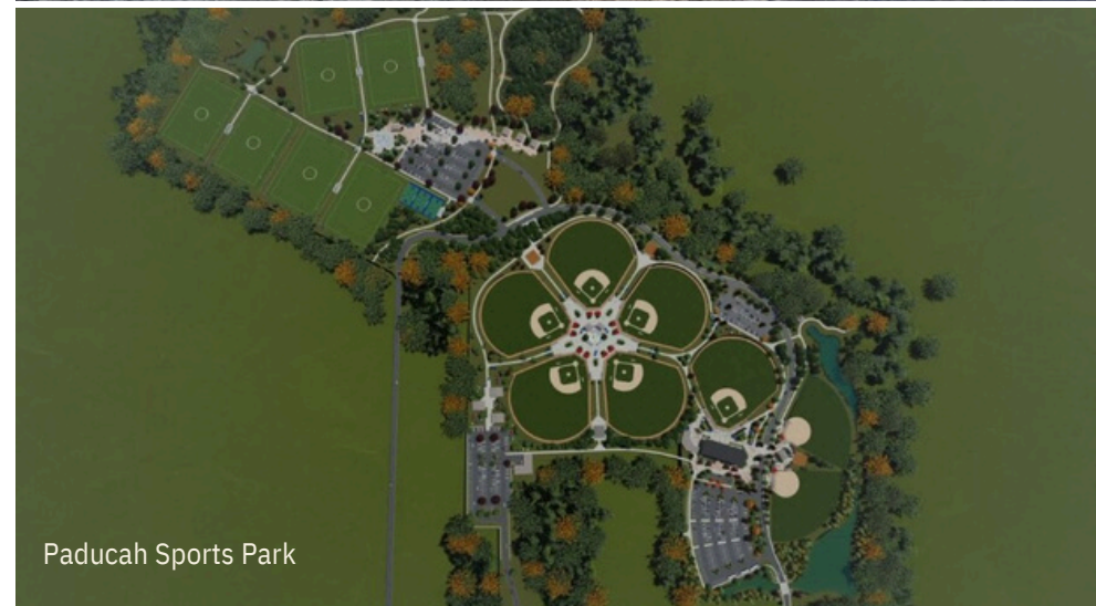
Paducah Sports Park