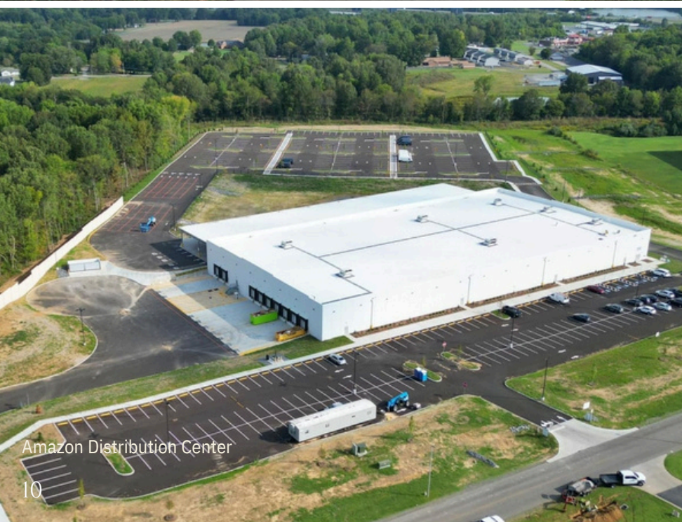
Amazon Distribution Center