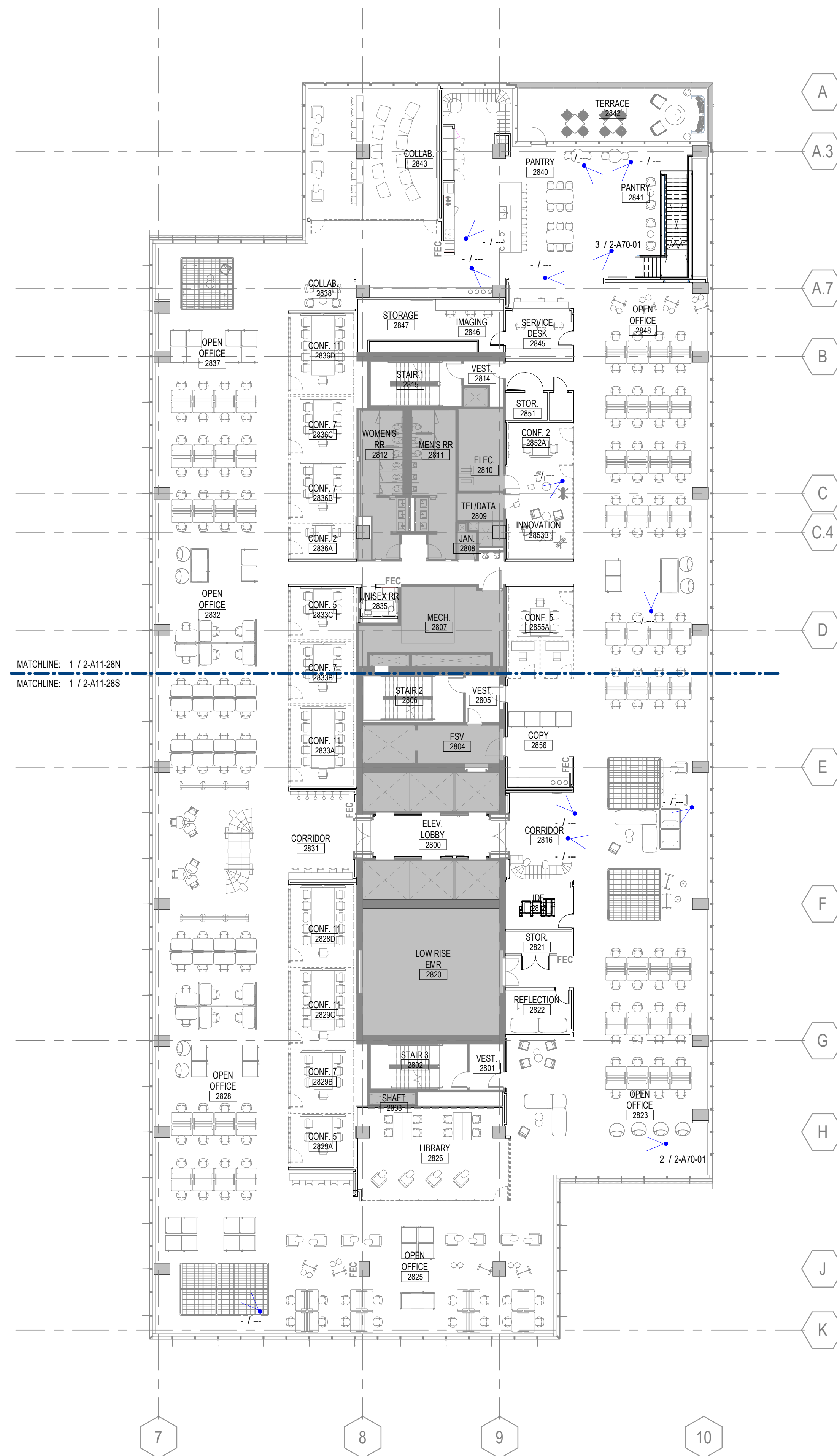
1 OVERALL FLOOR PLAN - LEVEL 28 1/16" = 1'-0"