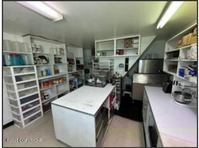
Bamboo Room Kitchen