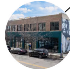
Reconciliation Services Redevelopment