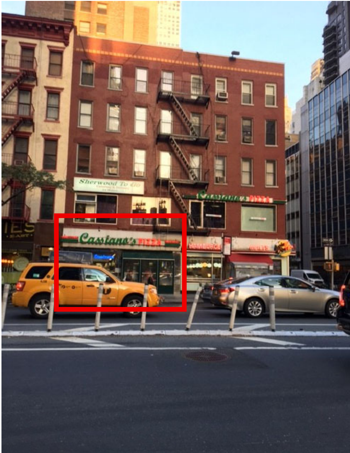
GROUND FLOOR SPACE ALONG 3RD AVE