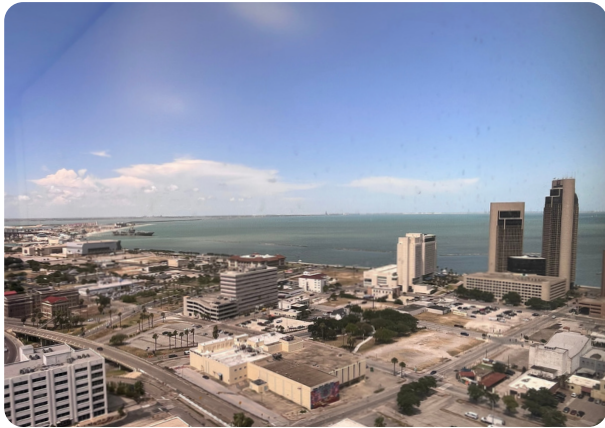
Bay Front View #1