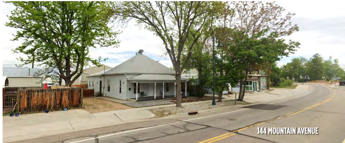
144 MOUNTAIN AVENUE