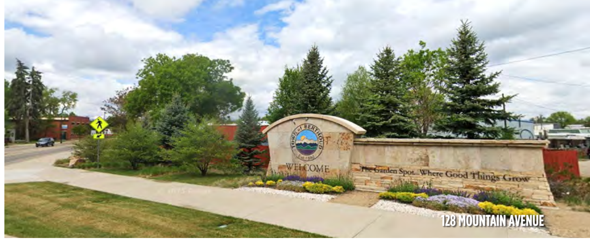
128 MOUNTAIN AVENUE