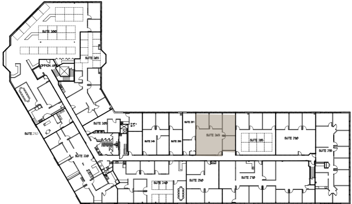
CROSSROADS 1300 BUILDING