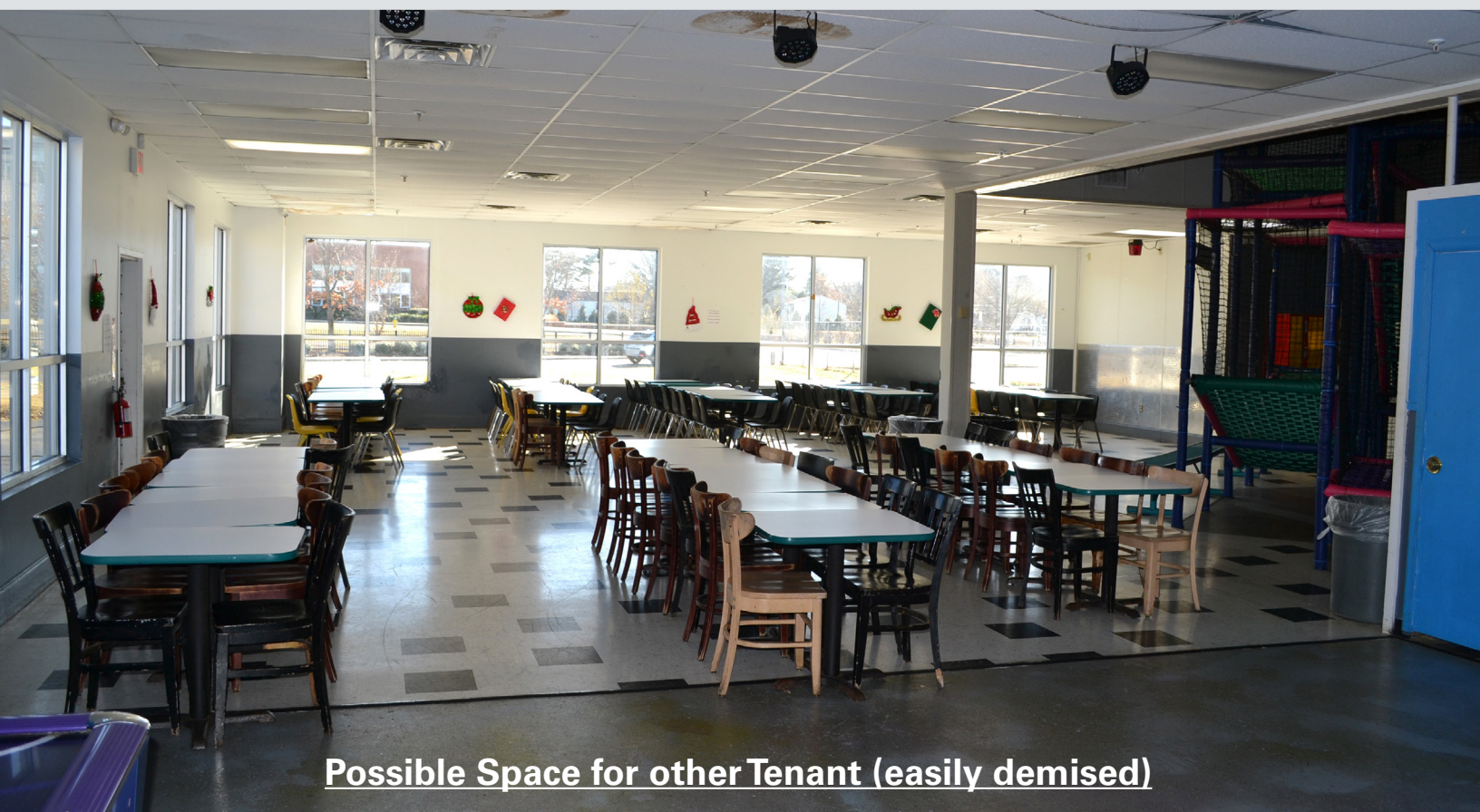
Possible Space for other Tenant (easily demised)