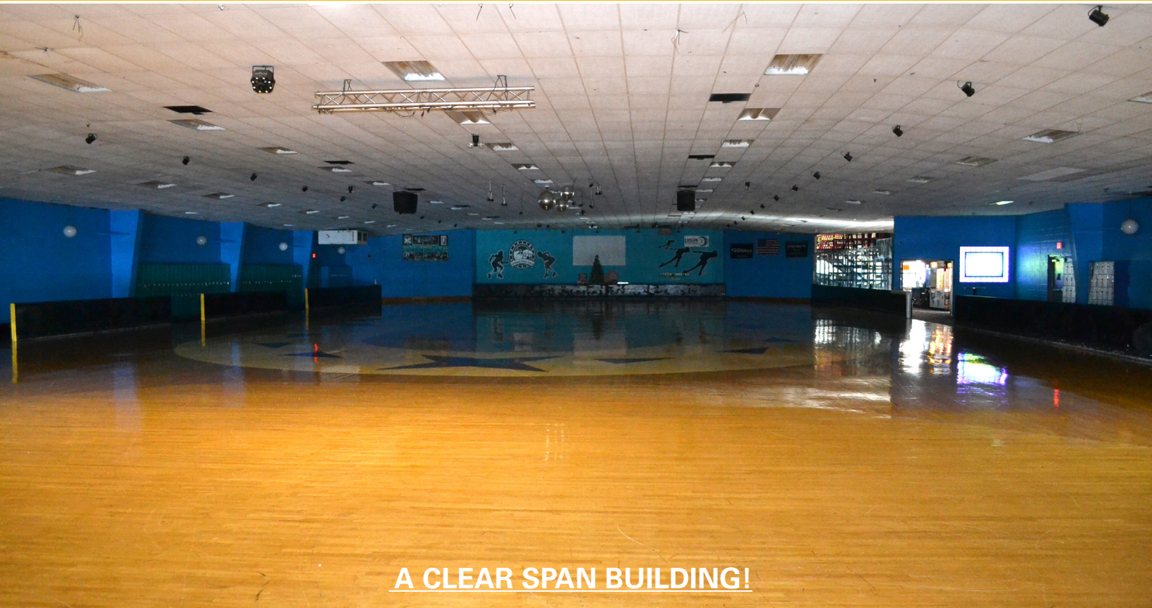
A CLEAR SPAN BUILDING!