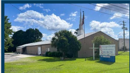
7860 DORCHESTER RD, NORTH CHARLESTON, SC 29418