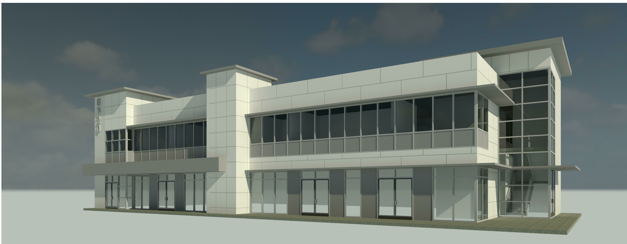
④ 3D View 2 N.T.S.