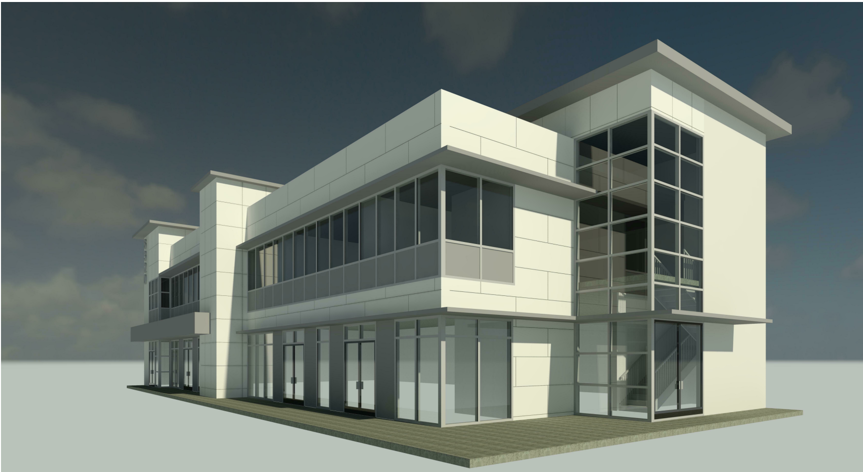
③ 3D View 1 N.T.S.