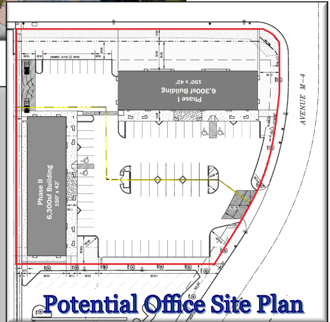
Potential Office Site Plan