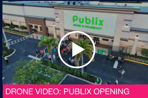
DRONE VIDEO: PUBLIX OPENING