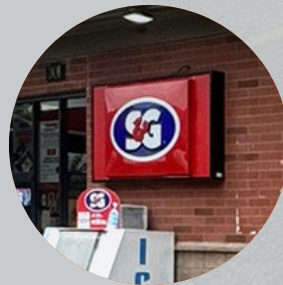
ADJACENT TO S/G STOREFRONT