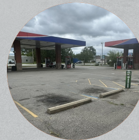
5 DEDICATED PARKING SPOTS