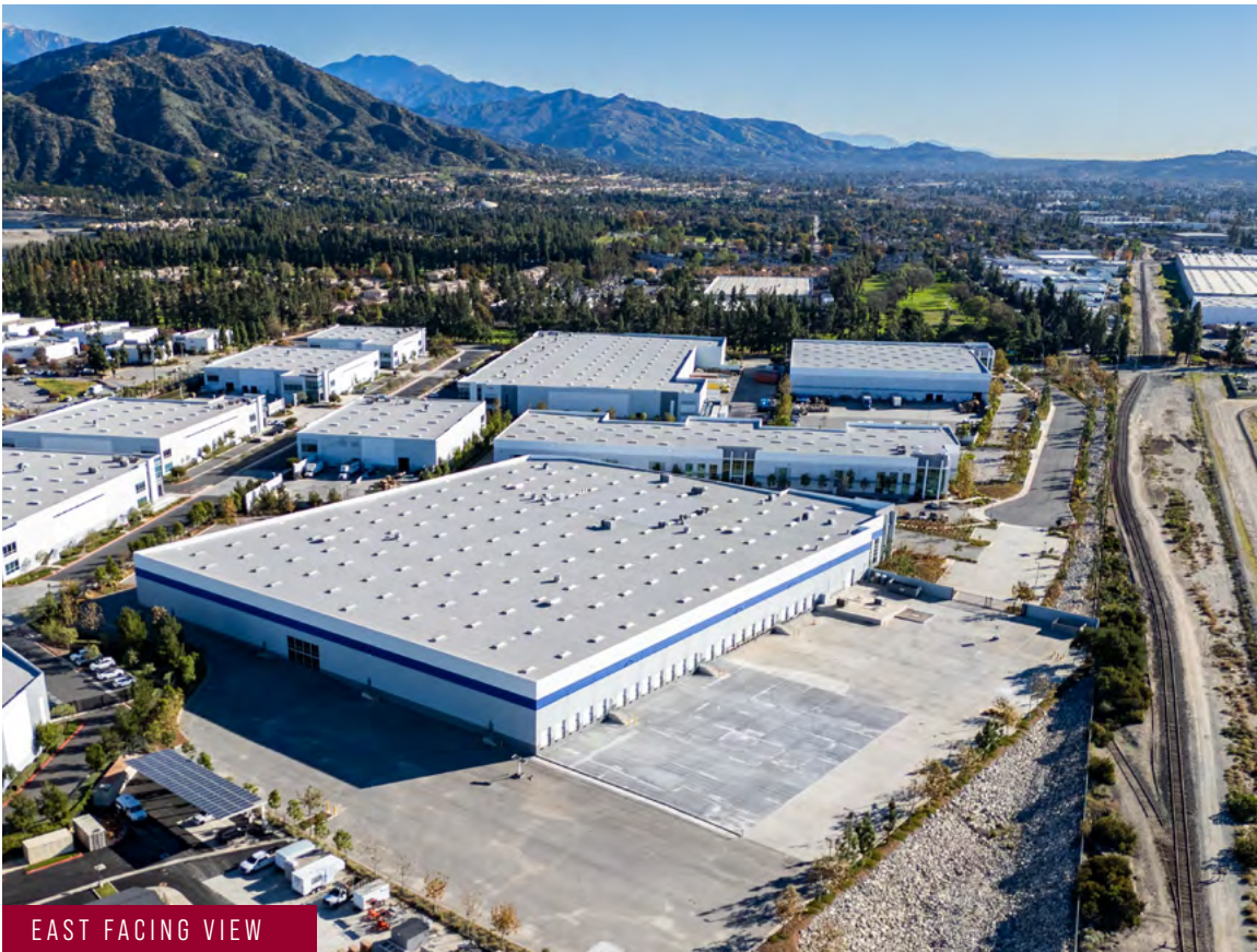
EAST FACING VIEW