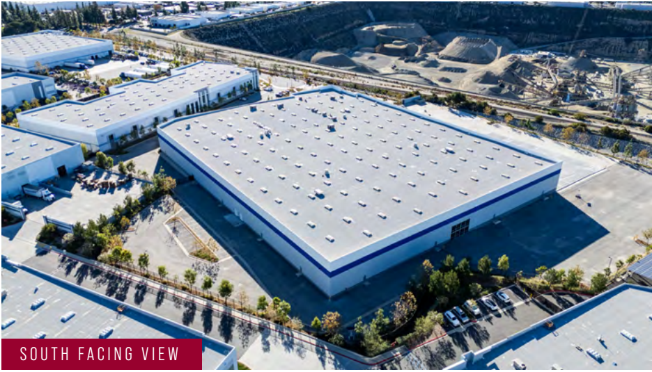
SOUTH FACING VIEW