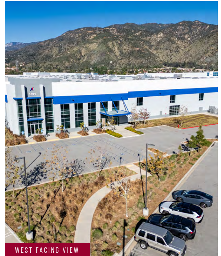
WEST FACING VIEW