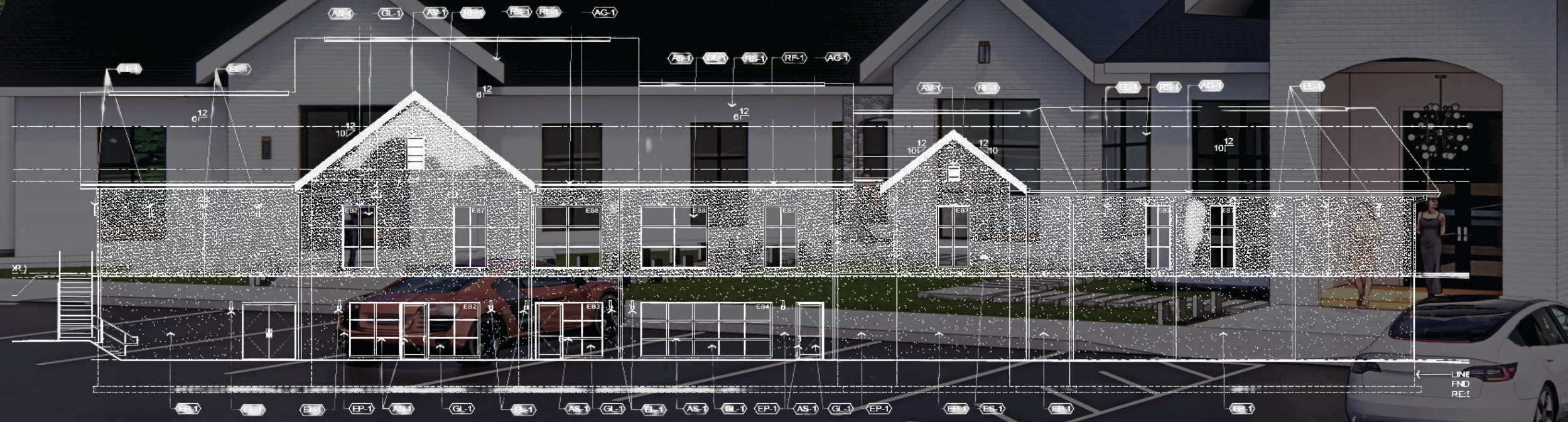
3 NORTH EXTERIOR ELEVATION 1/8" = 1'-0"