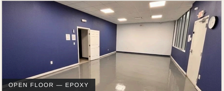
OPEN FLOOR — EPOXY