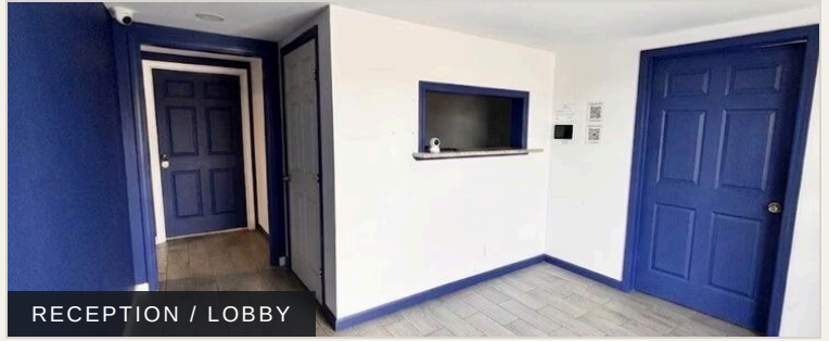
RECEPTION / LOBBY