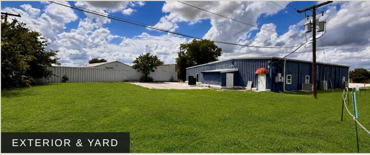
EXTERIOR & YARD