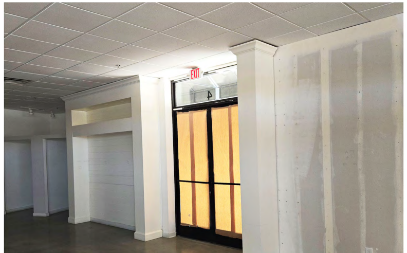
SUITE 4 - ENTRY VIEW