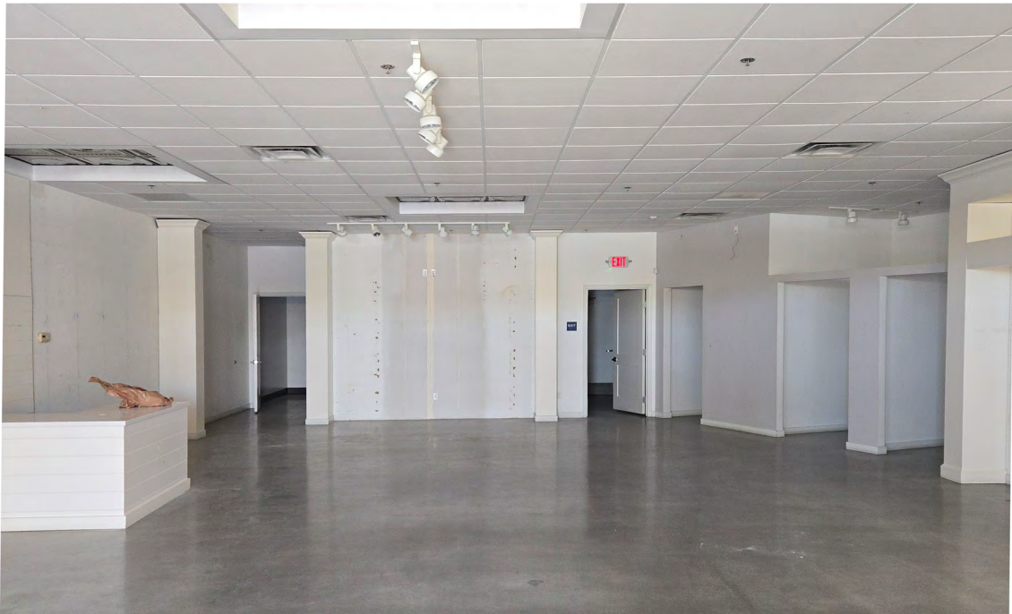
SUITE 4 - SALES FLOOR AREA