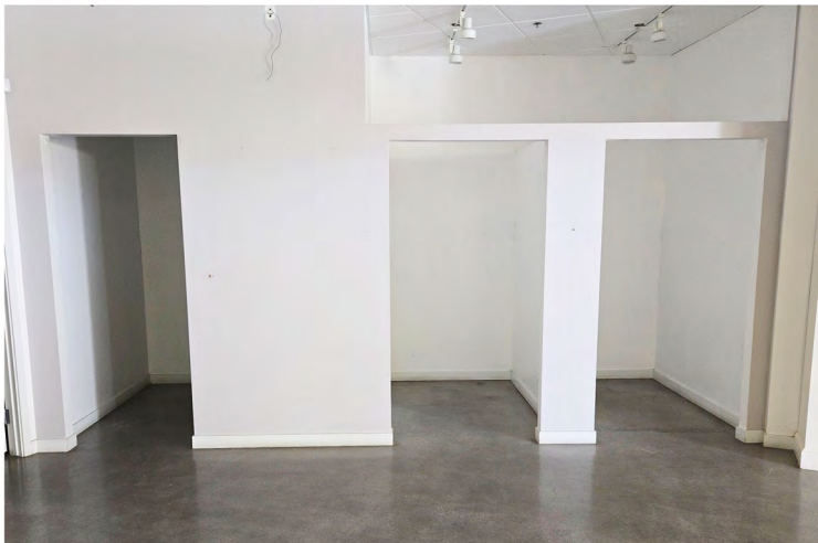
SUITE 4 - FORMER DRESSING ROOMS