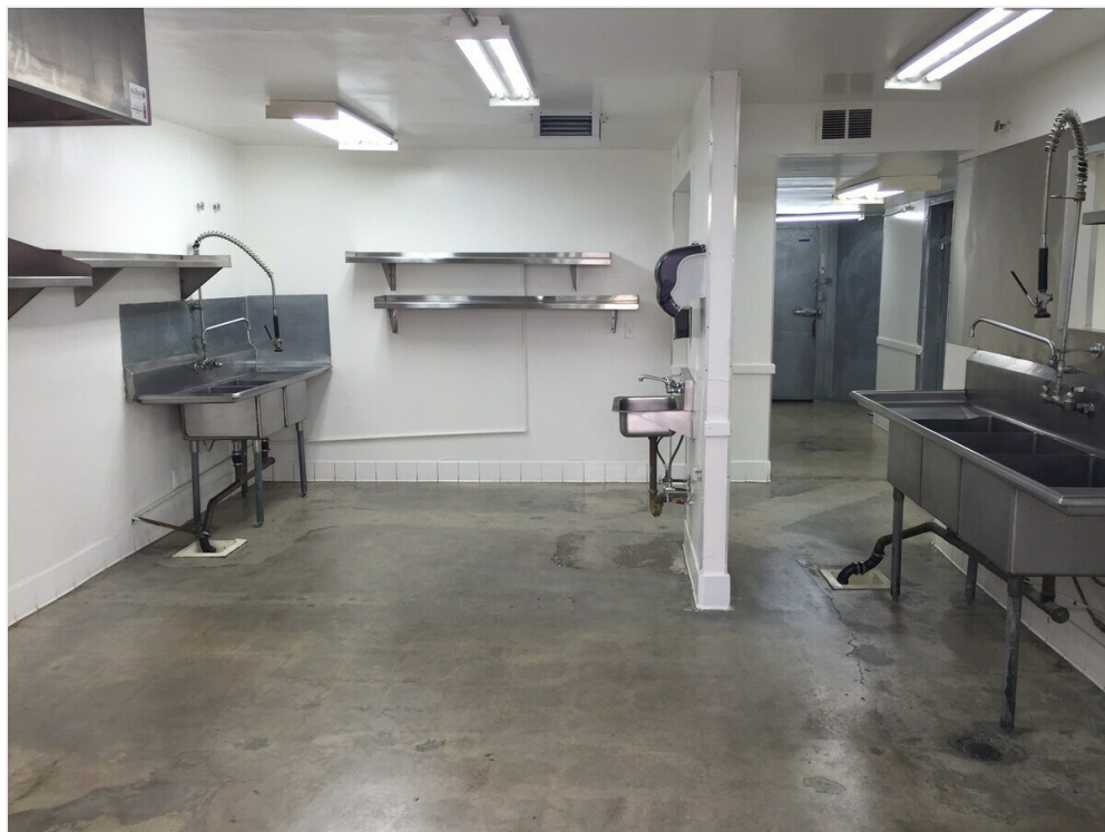
Online Cookie Bakery Business - sale