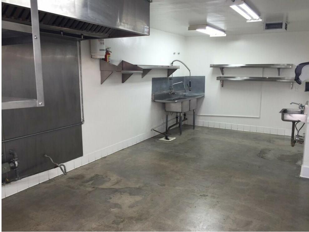
7539 Laurel Canyon Blvd