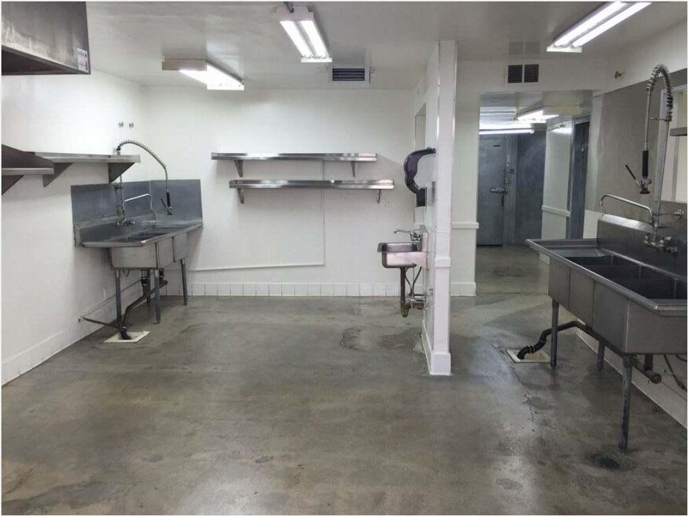
Online Cookie Bakery Business - sale