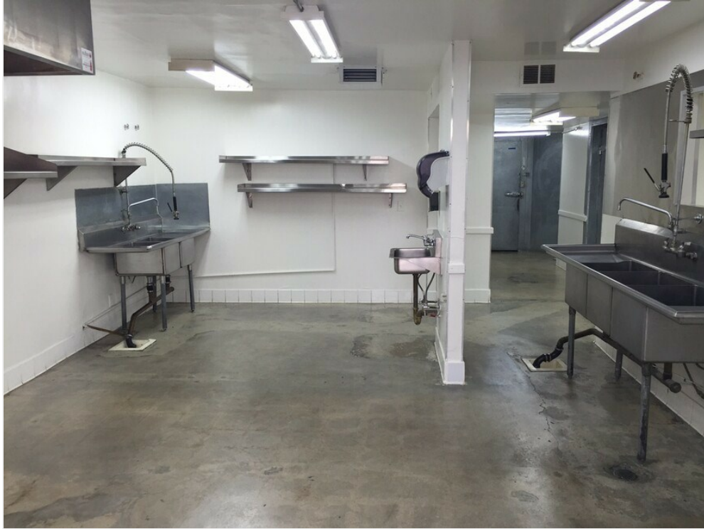
Online Cookie Bakery Business - sale