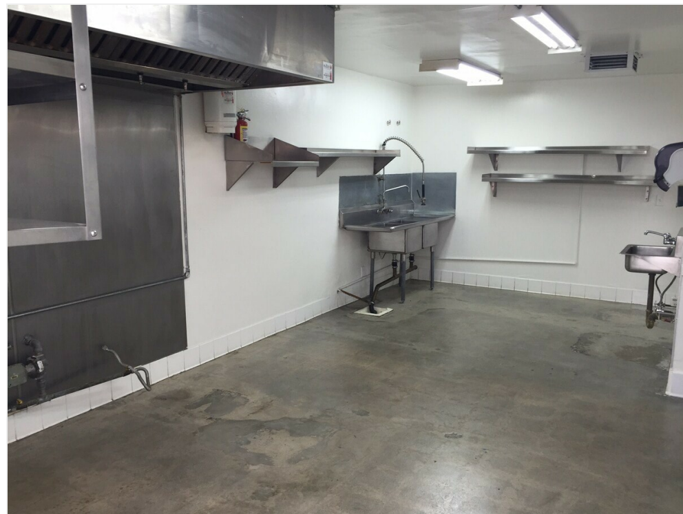
7539 Laurel Canyon Blvd