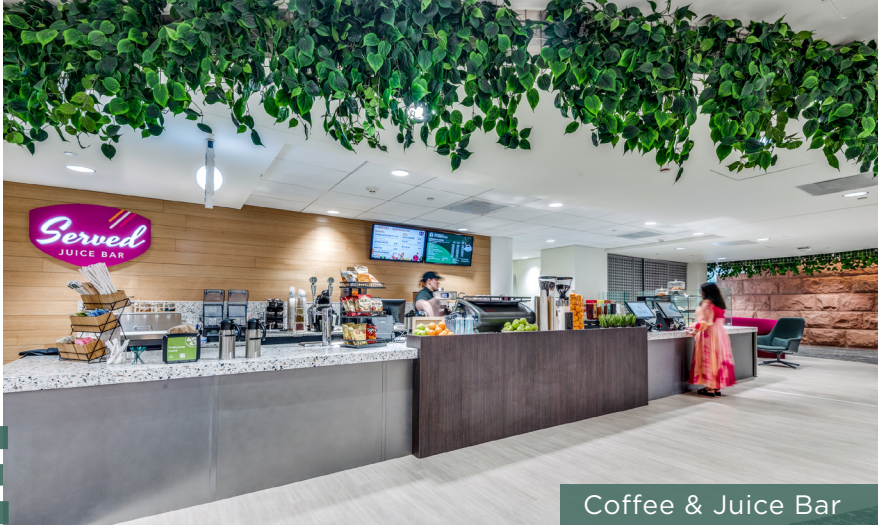
Coffee & Juice Bar