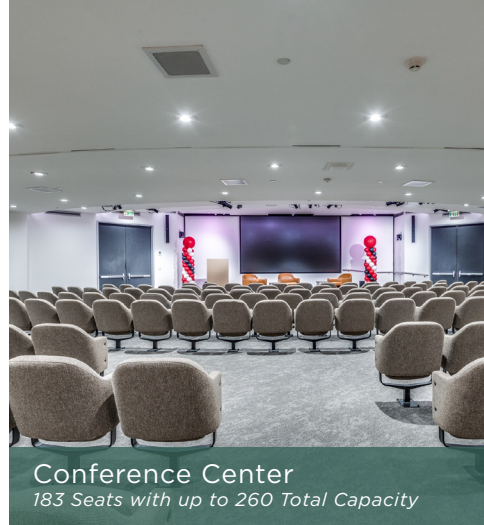
Conference Center 183 Seats with up to 260 Total Capacity