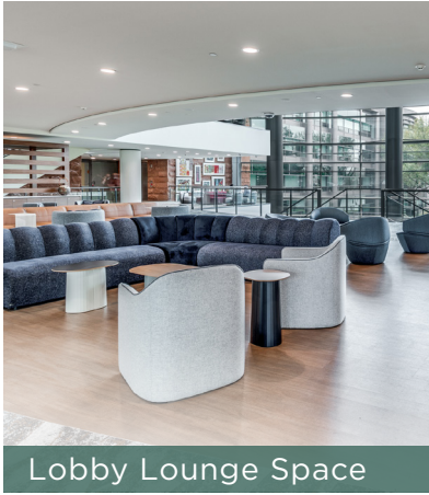
Lobby Lounge Space