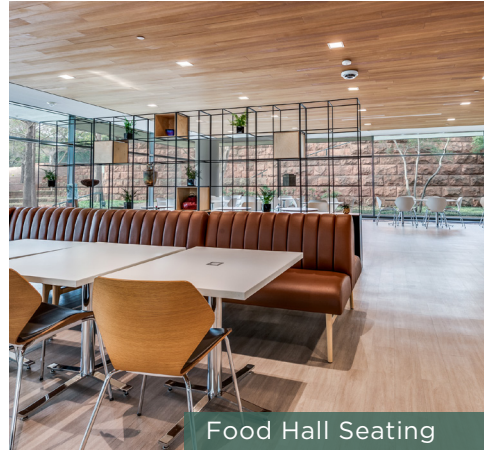
Food Hall Seating