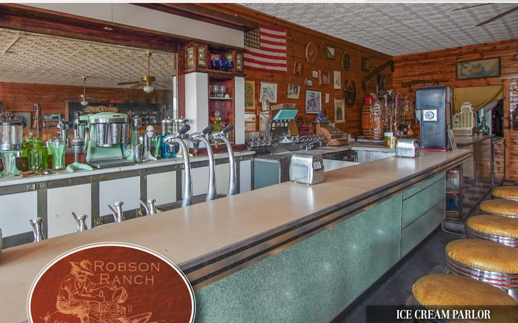
ICE CREAM PARLOR