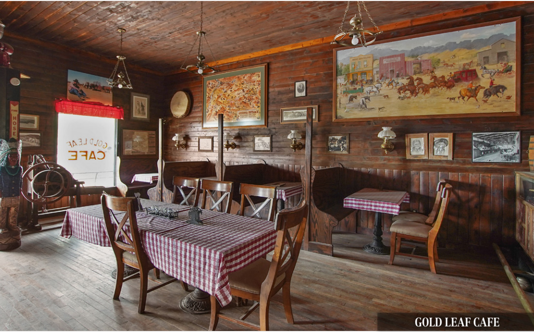
GOLD LEAF CAFE