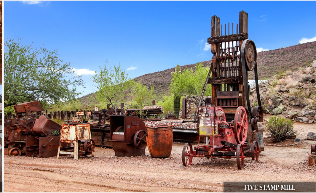
FIVE STAMP MILL