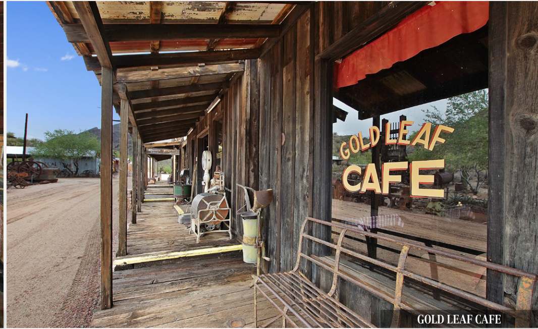
GOLD LEAF CAFE