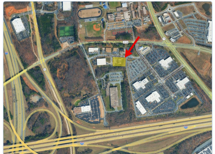
Approximately 1 mile from I-77 & I-485 interchange