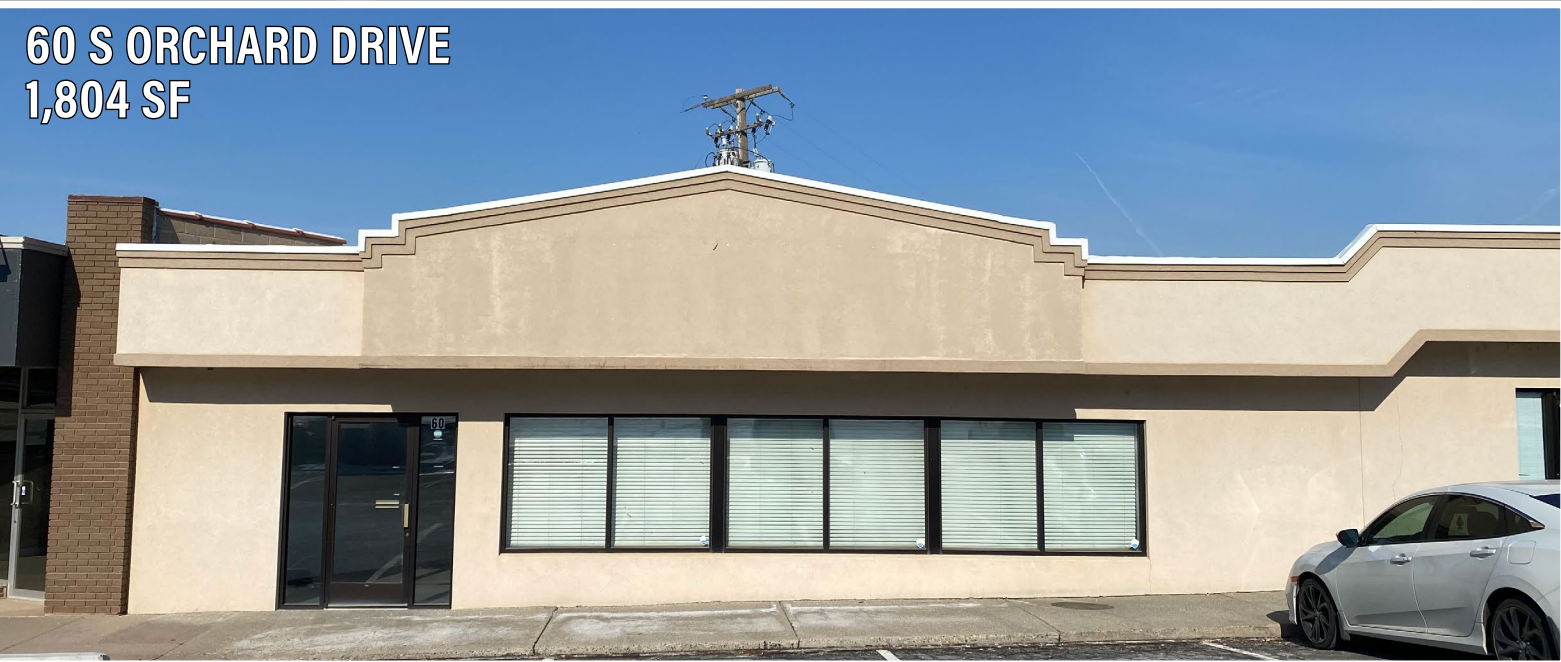
60 S ORCHARD DRIVE 1,804 SF