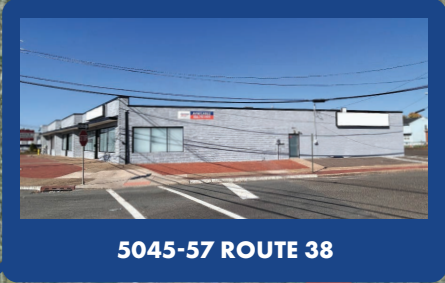
5045-57 ROUTE 38