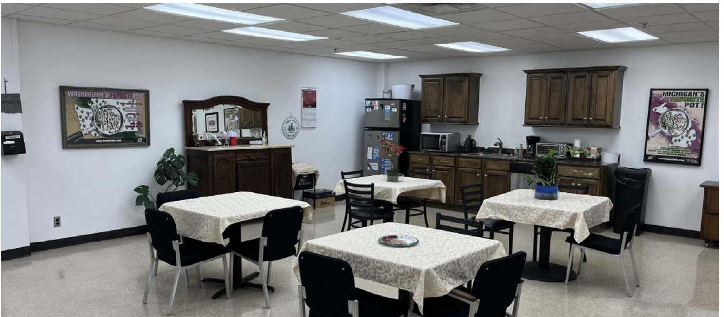
Kitchenette / Break Room