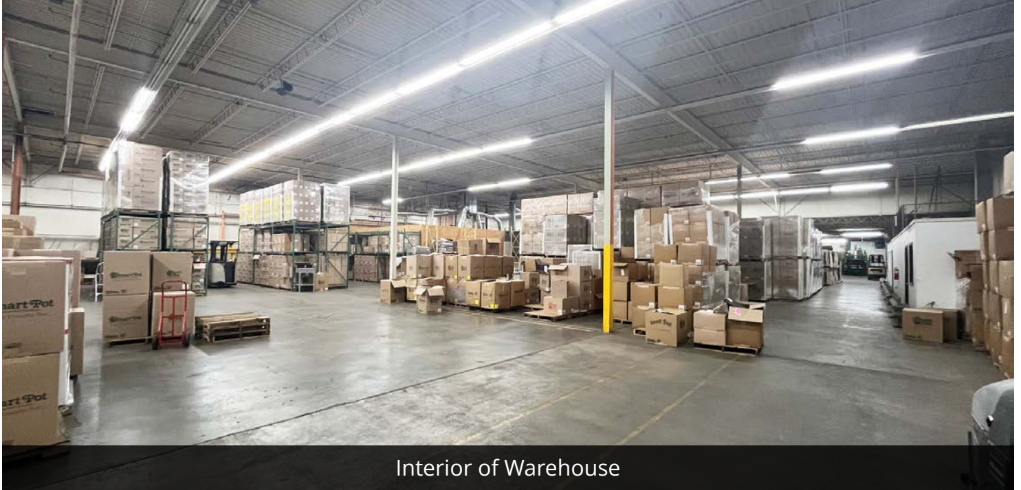
Interior of Warehouse