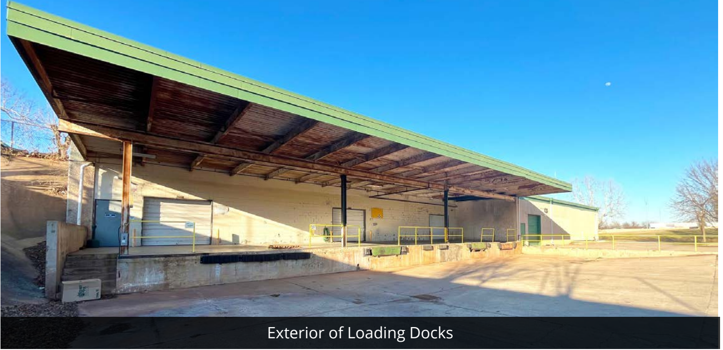
Exterior of Loading Docks