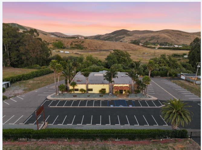
Aerial — building against the hills