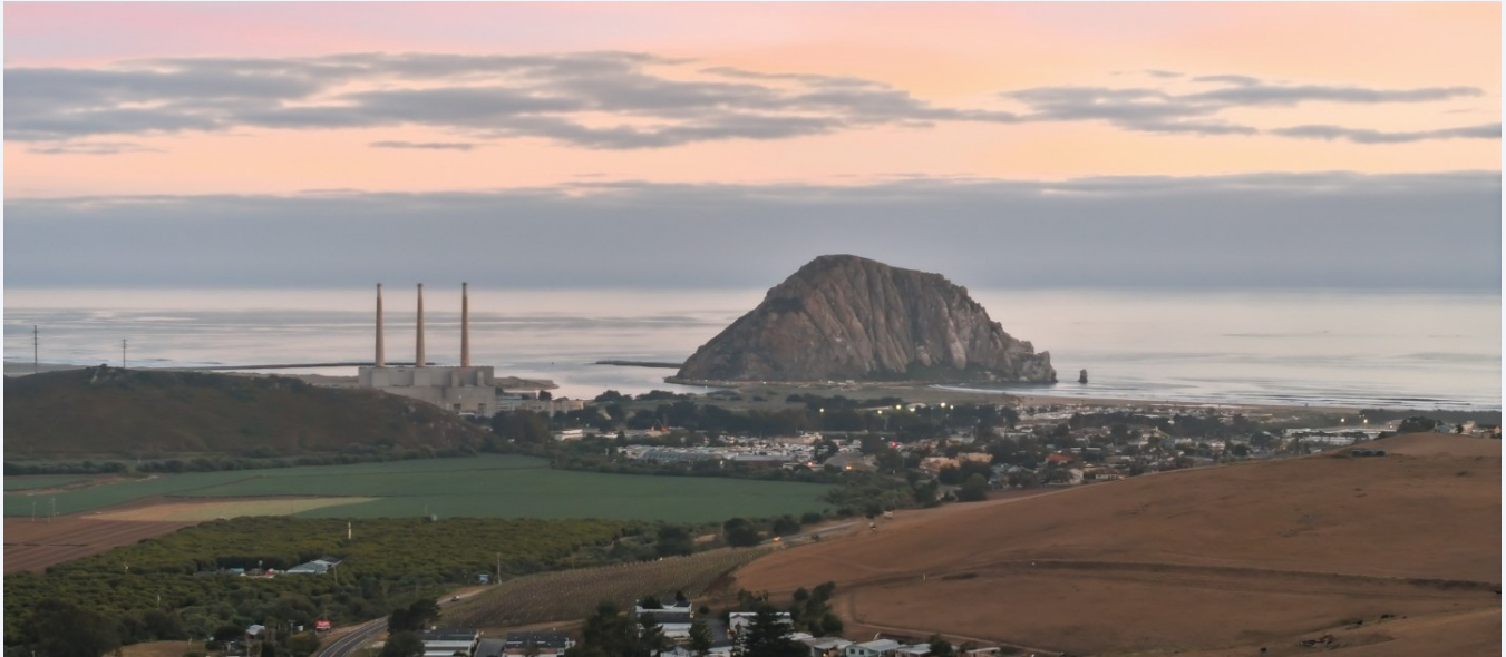
Morro Rock and the Estero Bay — minutes from the property.

The Lodge sits on State Highway 41 West at the eastern gateway into Morro Bay — one of California's most beloved Central Coast destinations. The property is minutes from the beach, the Embarcadero, downtown Morro Bay, and the iconic Morro Rock, while backing onto open rolling hills and farmland that give events a quintessential California-coast backdrop.