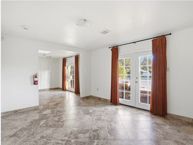
Interior — travertine floors & French doors