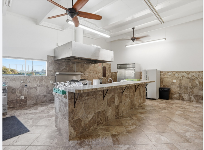
Commercial catering kitchen