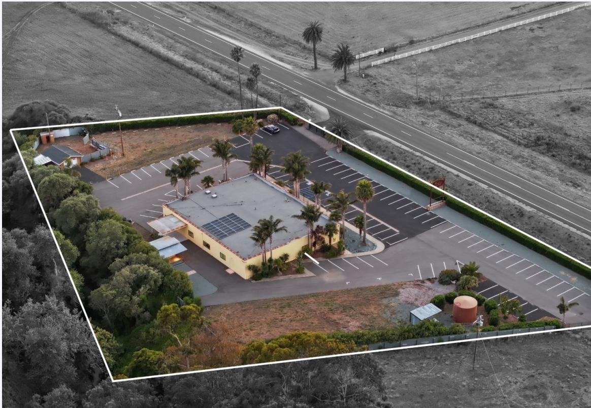
Approximate parcel boundary (APN 073-085-016). Lot lines shown for illustration; not a survey.