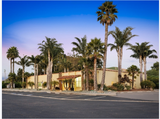
Front entry at dusk