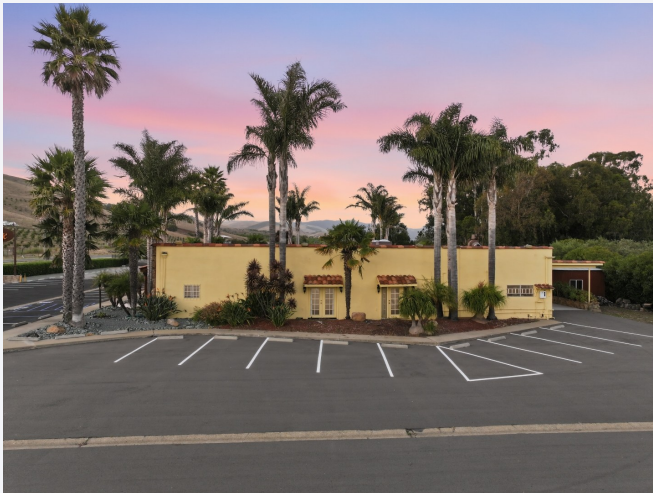
Refreshed exterior, landscaping, and newly paved/striped lot.

New windows building-wide — improved efficiency, light, and presentation across the main hall and supporting rooms.