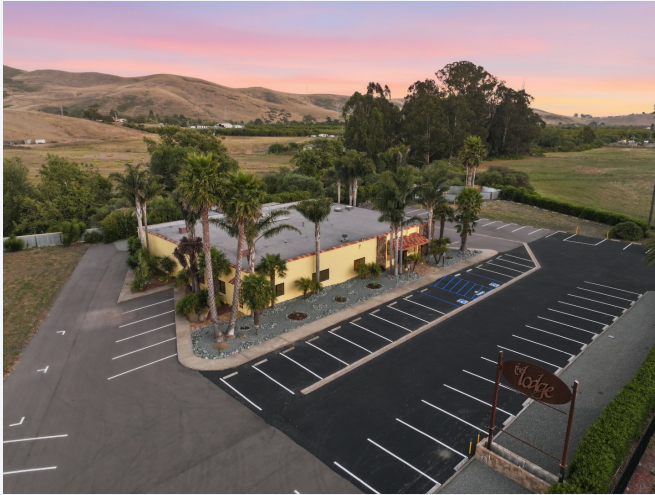
Aerial — building, signage & striped lot