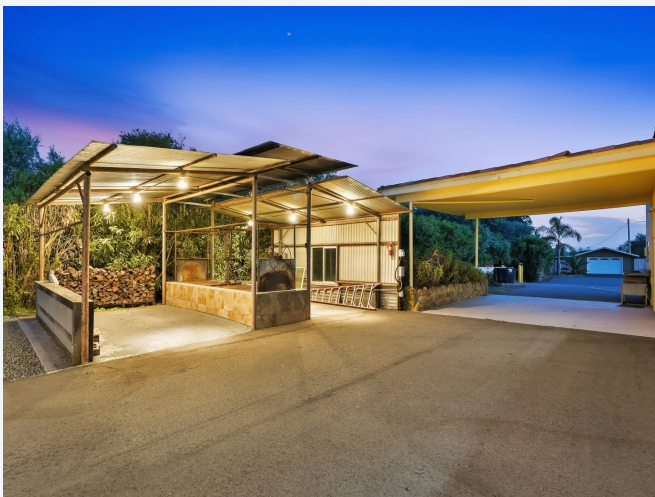
Covered BBQ patio & drive-through