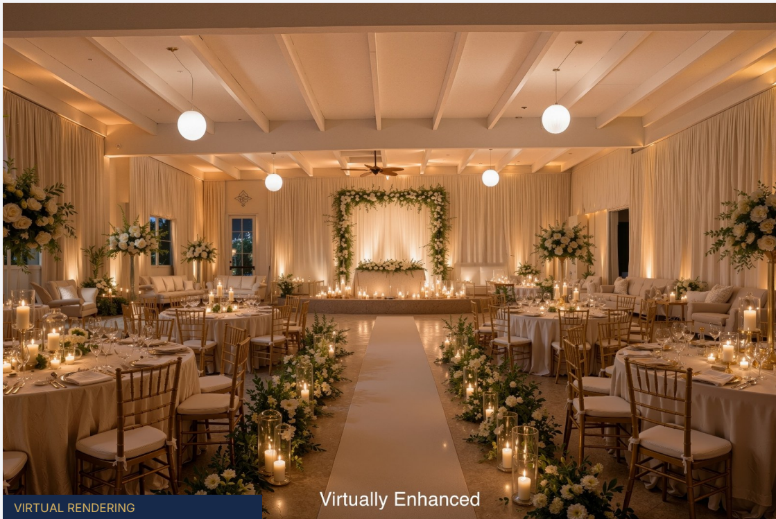
Wedding configuration — virtually enhanced for illustration

The following images illustrate the venue's potential across event types. Renderings are provided for illustrative purposes only.