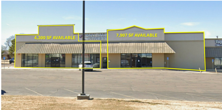
SUITES AVAILABLE FOR LEASE