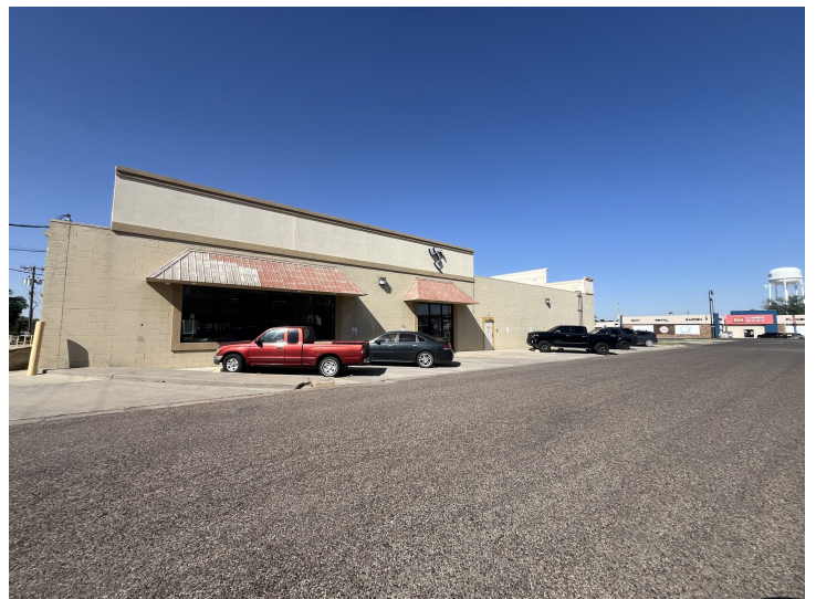
SOUTHERLY SIDE OF BUILDING, ANGLED PARKING

troy@creekcre.com 405.219.7500 TROY HUMPHREY