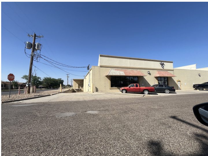
LOADING DOCK FOR 7,907 SF SUITE