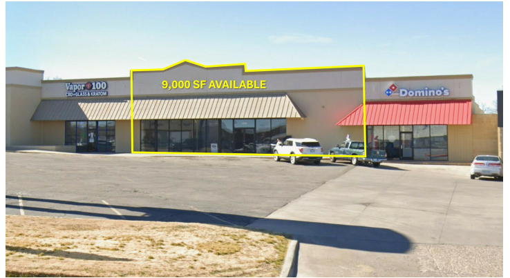
SUITE AVAILABLE FOR LEASE